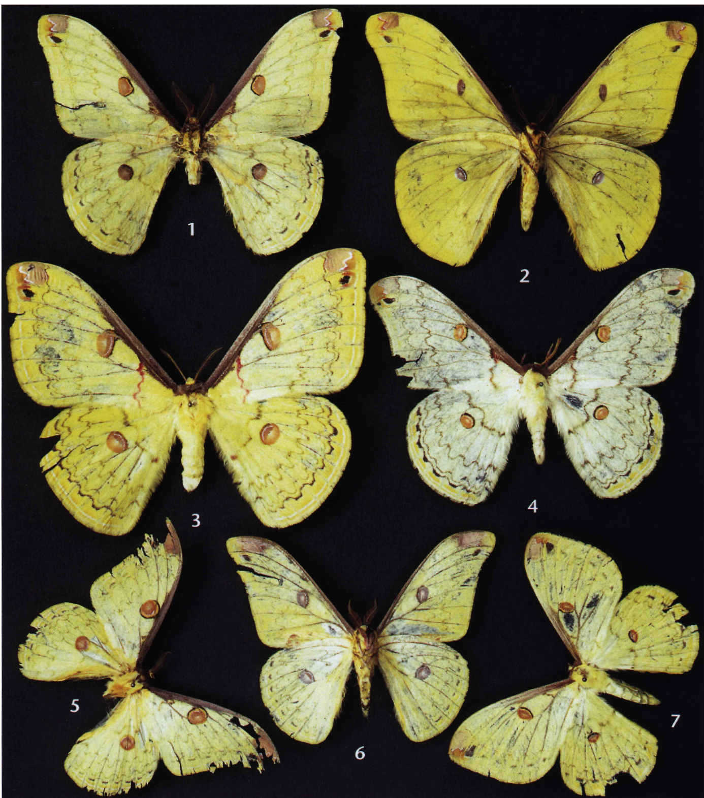
Colour plate. Specimens of Loepa of the miranda -group from China. Fig. 1: Loepa tibeta , ♂ holotype, dorsal view. Fig. 2: L. tibeta , ♂ paratype, ventral view. Fig. 3: L. miranda , ♀, dorsal view, from the type locality of L. tibeta . Fig. 4: L. yunnana , ♂ lectotype, dorsal view. Fig. 5: L. meyi , ♂ holotype, dorsal view. Fig. 6: L. meyi , ♂ paratype, ventral view. Fig. 7: L. meyi , ♀ allotype, dorsal view. — All specimens to the same scale. — Photograph U. BROSCHE.

of similar colour, antemedian band grey, postmedian and double submarginal band similar to forewing, but outer portion of the submarginal band with dark bluish scales. Hindwing ocellus without or less developed outer black portion, 4–5 mm in maximum diameter. From ventral side in absolute similar ground colour and with similar pattern, but antemedian band of the forewing missing and ocelli of both fore- and hindwings lighter, suffused with white scales in the inner part.